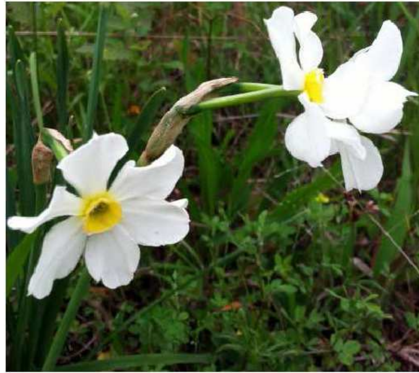
Figure 9. Narcissus × medioluteus , old field, Calhoun Co., Alabama, 28 Apr 2014.